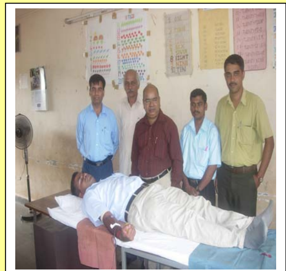
Project director, Goa SACS present during Blood Donation Camp at Nevra