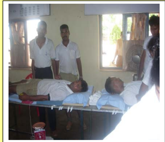
Blood Donation Camp at 5 TTR, Bambolim