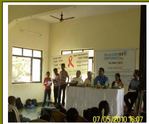
Children performing during the event