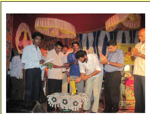
Inauguration of RRC at Pernem