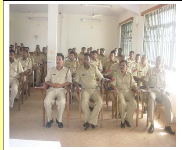
Police personnel attending the training