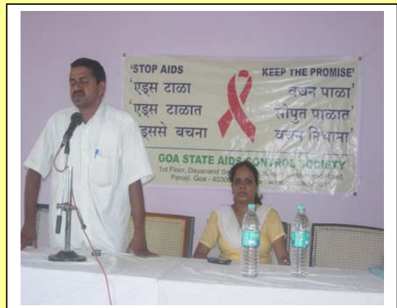
DD (IEC) taking the session