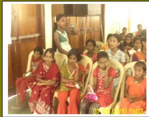
Children attending the programme